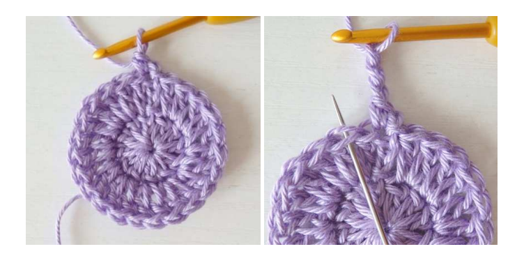
Ch 3, skip 1 dc, skip the first ch at the beg of the round, sl st in next sc.