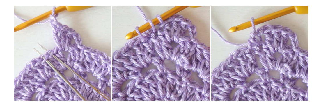
(Ch 1, skip 1 dc, 3 dc in next ch-1 space, ch 1, skip 1 dc, 1 sc2tog in next 2 dc) 10 times.

Round 5 : Ch 2 (counts as 1 sc + ch 1 ), skip 1 dc, 3 dc in next ch-1 space, ch 1, skip 1 dc, 1 sc2tog in next 2 dc.